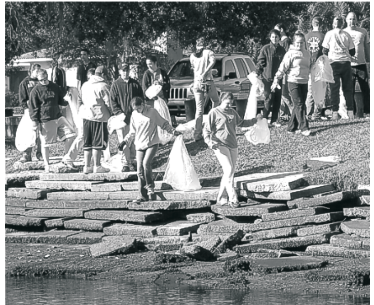
Tampa Mayor's 20th Annual Hillsborough River & Waterways Clean Up Lowry Park Boat Ramp Saturday, November 17th