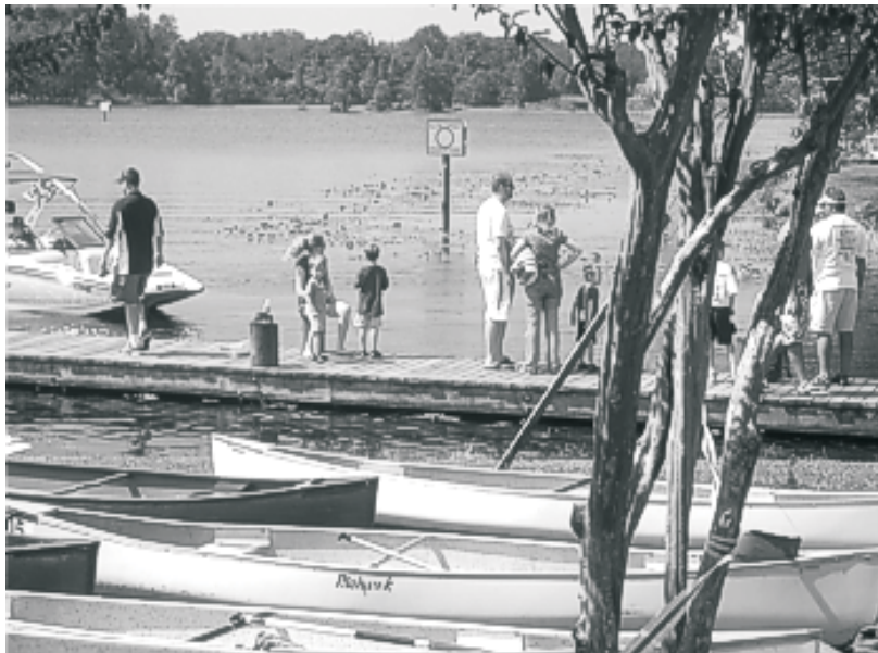
RiverFest 2007 City of Temple Terrace Riverhills Park Saturday, October 20th