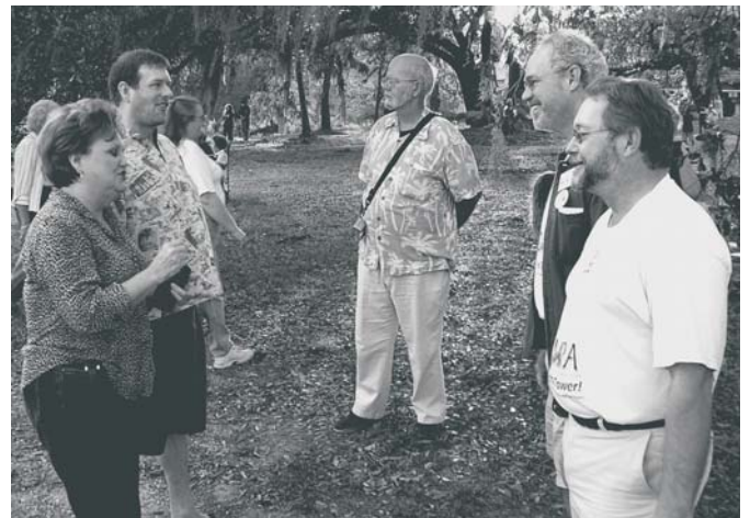
Friends of the River held a neighborhood membership drive and talked river issues with those visiting the park site.