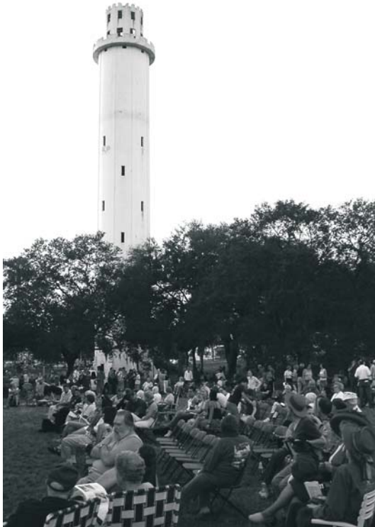
As dusk gathered, folks from around the community listened to music and visited the tower, the river and with each other.