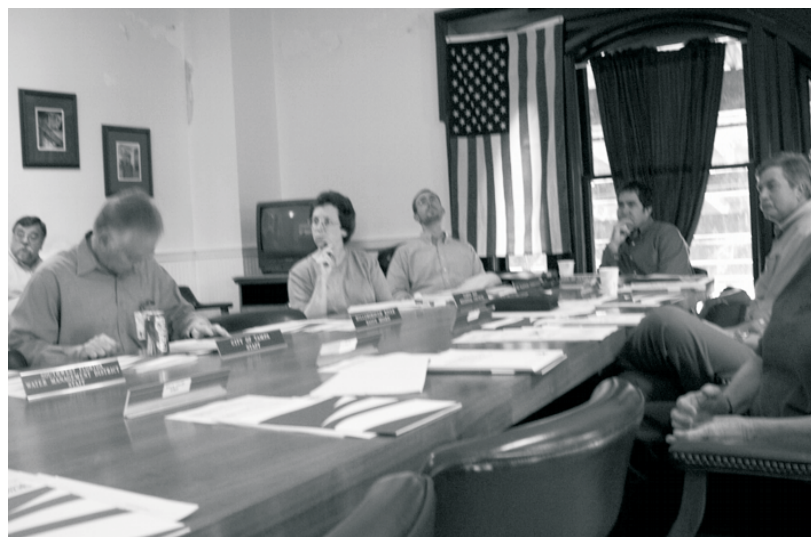
TAC members shown contemplating information presented at recent meeting.

Future TAC meetings scheduled are on the third Tuesday of each month. All TAC meetings are scheduled to be held at the Tampa Union Train Station second floor meeting room unless otherwise noticed. TAC meetings begin at 1:30 p.m. To review River Board and TAC agendas visit our website at www.hillsboroughriver.org and click on Agendas under the River Board/TAC logo or contact staff at 273-3774, extension 323.